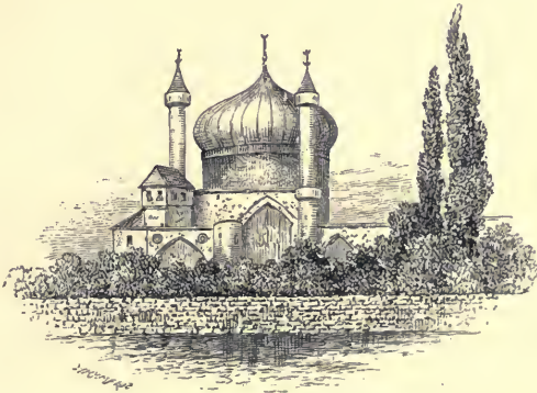
THE SHRINE OF FATIMA.

The shrine of Fatima, the sister of Reza the eighth